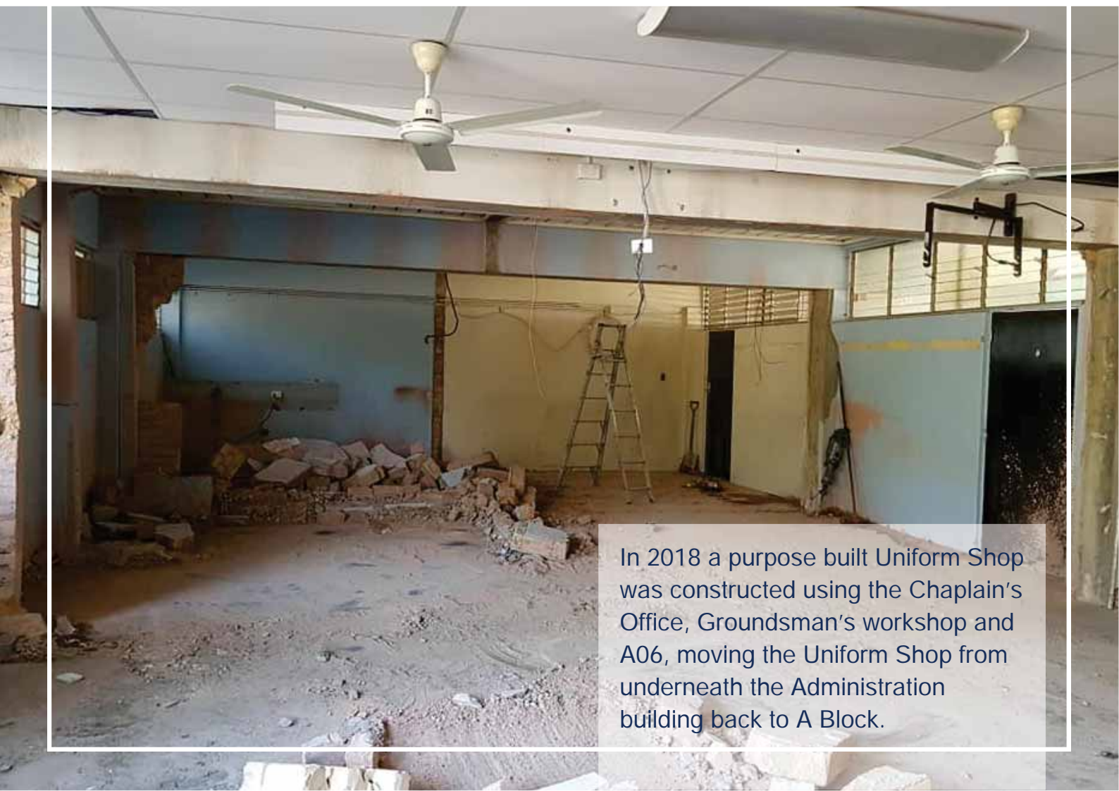
In 2018 a purpose built Uniform Shop was constructed using the Chaplain's Office, Groundsman's workshop and A06, moving the Uniform Shop from underneath the Administration building back to A Block.